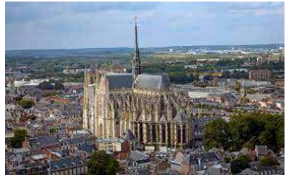
Two perspectives of the Amiens Cathedral, Amiens, France