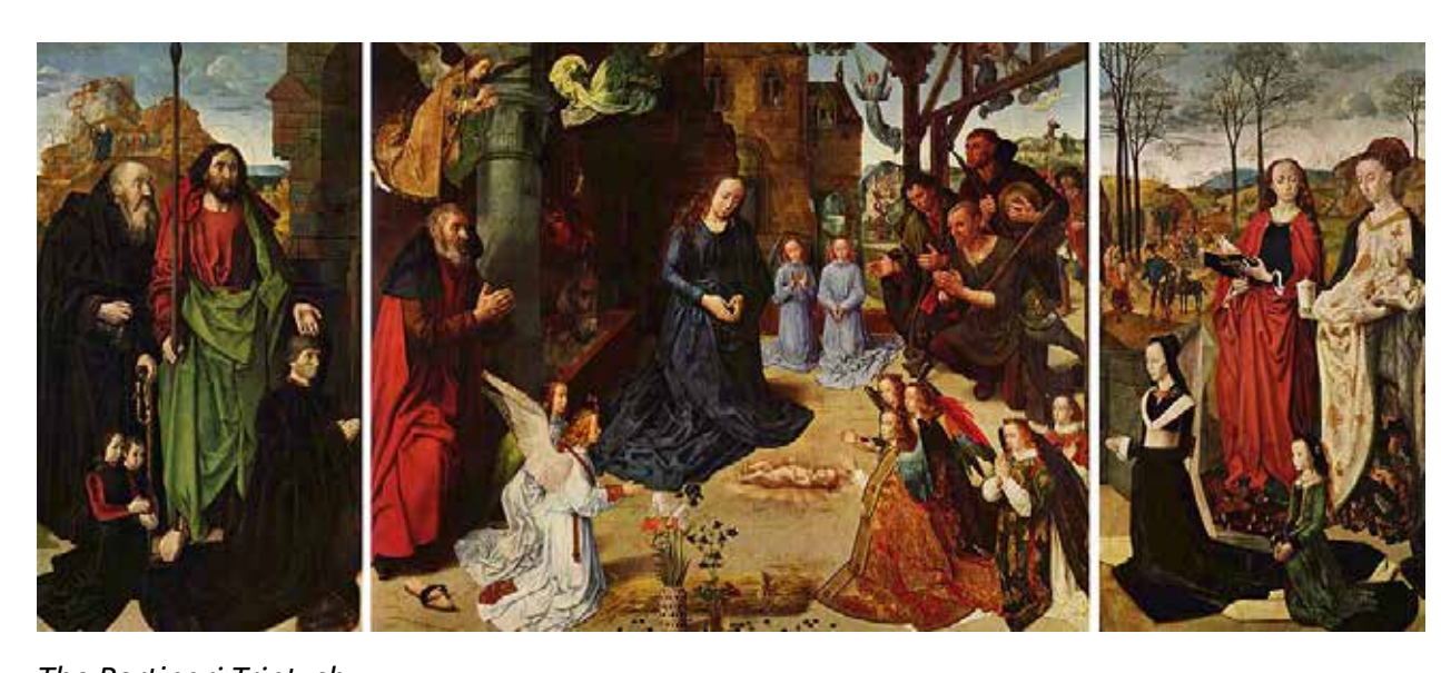
The Portinari Triptych,

The shepherds returned, glorifying and praising God for all they had heard and seen, as it had been told them.