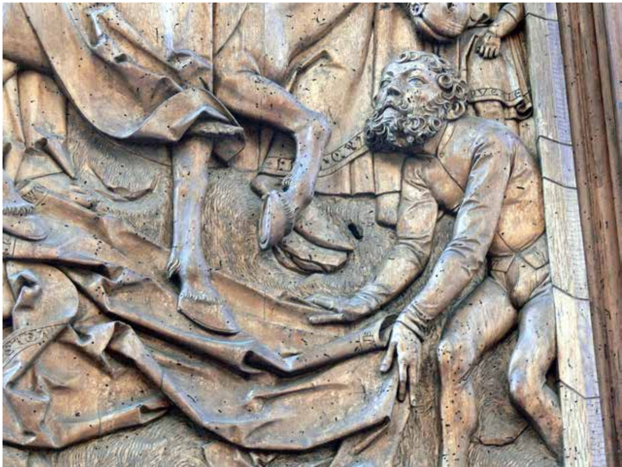
Close-up of the lower portion of the altarpiece's left panel, focusing on a cloak being laid under the colt's hooves as Jesus rides into Jerusalem.

Mary Magdalene and Mary the mother of Jesus saw where the body was laid.