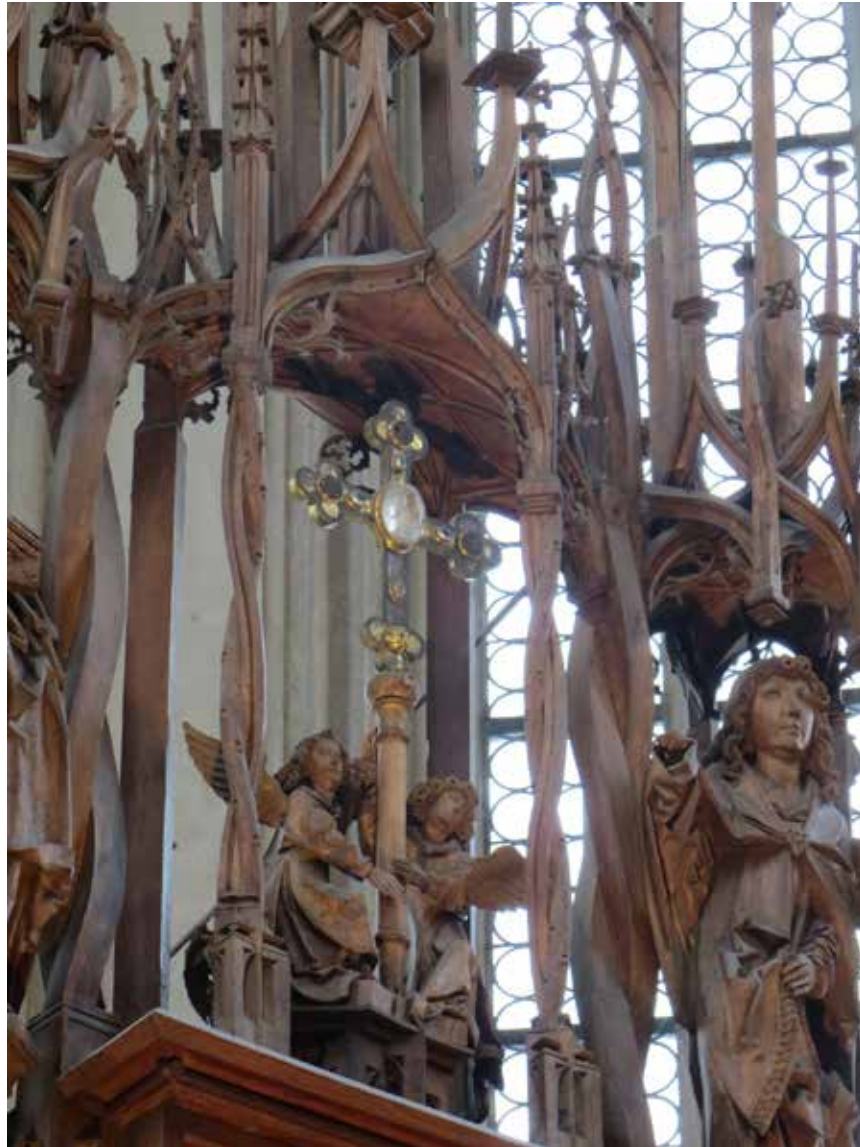
Close-up of the section of the Altar of the Holy Blood where a small sample of Christ's blood is said to have been placed. This relic was encased in rock crystal and set in the center of the cross.