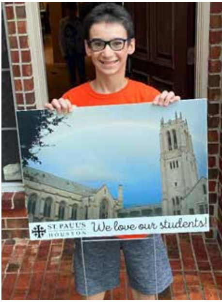
A St. Paul's Youth shows off his yard sign. These signs were distributed to families with children and youth in September, and they are now available for everyone to pick up in the Sanctuary Building reception area any time the building is open. Current building hours are Monday-Thursday, from 10 am to 2 pm. Get yours today, and show your St. Paul's pride.

Next meeting: Friday, October 9, at 10:30 am via Zoom. To connect, email hspaw@stpaulshouston.org. All interested parties invited.