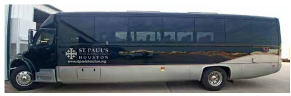
St. Paul's new 36-passenger bus. The smaller vans are white, also with St. Paul's logos.

regulations for a Multi Function School Activity Bus (MFSAB), meaning that pre-school children may safely ride in it. This joins another 14-passenger MFSAB-rated van, purchased by St. Paul's School, that will be kept.