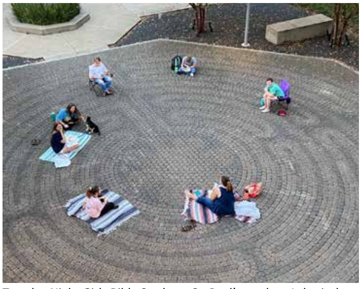
Tuesday Night Girls Bible Study on St. Paul's outdoor Labyrinth

Saturdays: Porch Party. 5-7 PM at host homes