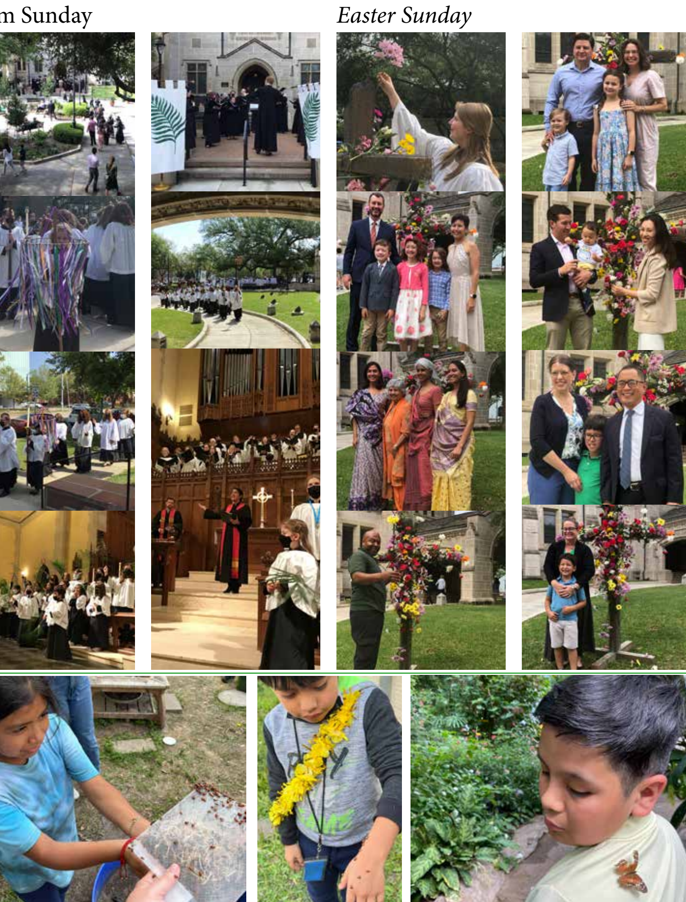
The Rutabaga After-School Program children celebrated Earth Day by releasing ladybugs into St. Paul's Community Garden and visiting the Houston Museum of Natural Science Butterfly Center.