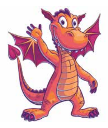
Sparky the Dragon invites all children to VBS.