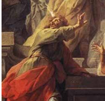
Thumbnail of art for Pentecost Sunday's Lectionary

The texts for each week are provided on St. Paul's website and app plus the church's information racks. These are illuminated by art curated by Norman Mahan. On the website, these are included with the Sunday morning worship service information in the calendar, www.stpaulshouston.org/calen dar . That service information also includes the sermon titles and music to be sung on that Sunday.