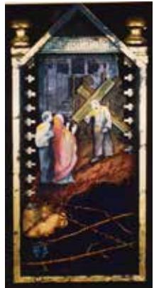
Fourth Station: Jesus Meets His Mother

Mixed media art in shadow boxes depicting the Stations of the Cross has been donated to St. Paul's by Houston artist