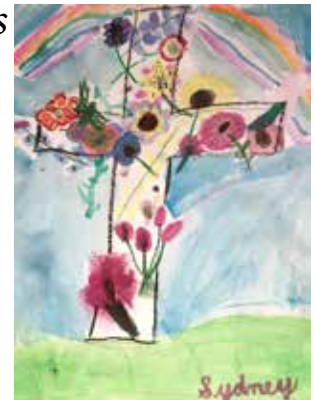
Cover of 2021 My Lent and Easter Book illustrated by St. Paul's children.

The complete schedule of Holy Week Services is on page 8 as well as at www.stpaulshouston.org/lent.