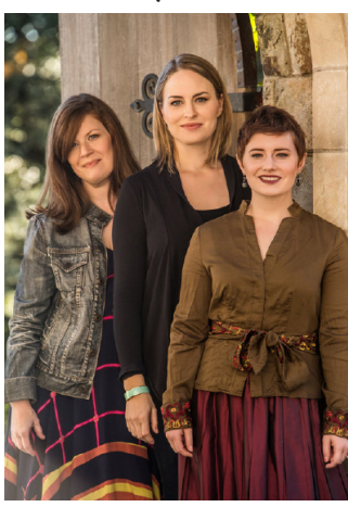
Eya presents Pilgrimage March 5 at 7:30 pm.

Thursday, March 5. 7:30 pm. Eya presents Pilgrimage