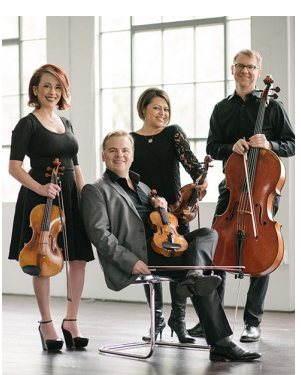
Apollo Chamber Players March 19 at 12:15 pm.

Thursday, April 2. 12:15 pm. St. Paul's Consort, a chamber choir of singers from St. Paul's Choir, sings Tudor and Elizabethan music for Lent and Holy