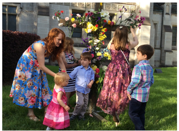
Flowering of the Cross, a St. Paul's Family Easter tradition, will return to the lawn this year. — Photo from 2018