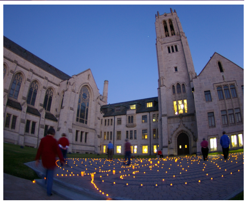
Night Labyrinth Walk soon after installation was completed.

All are invited to participate in the Lenten Sacred Space in the Jones Building Foyer beginning March 1. Return to this Sacred Space throughout Lent and watch it transform.