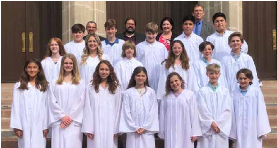
St. Paul's 2021-22 Confirmation Class. See names below.