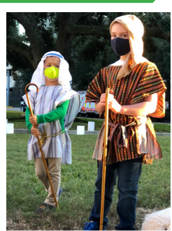
A few of our Joy to the World! angels and shepherds. For more Joy to the World! pictures, see page 2.