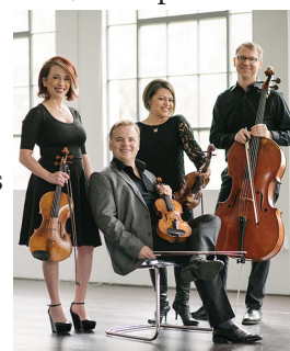
Apollo Chamber Players

Thursday, March 19. 12:15 pm. Apollo Chamber Players presents "Music of the Americas," a program featuring newly commissioned works by Grammy and Pulitzer Prize-winning American composers Libby Larsen and Jennifer Higdon, and music by Silvestre Revueltas (Mexico), Heitor Villa Lobos (Brazil), and Leo Brouwer (Cuba).