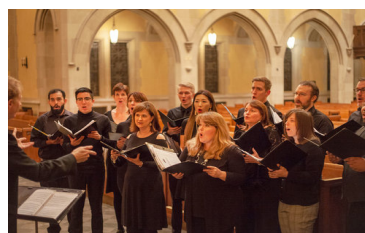
St. Paul's Consort

choir of singers from St. Paul's Choir, sings Tudor and Elizabethan music for Lent and Holy Week: William Byrd's Mass for Five Voices and works by Orlando Gibbons, Thomas Tallis, and John Sheppard.