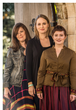
Eya presents Pilgrimage

Thursday, March 5. 7:30 pm. Eya presents Pilgrimage that follows the humming routes of the Camino de Santiago as well as the path towards the mountaintop monastery of Montserrat with music of medieval Spain from the Codex Calixtinus, Las Huelgas Codex, and the Llibre Vermell.