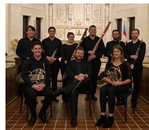
Space City Winds

Thursday, April 2. 12:15 pm. St. Paul's Consort, a chamber