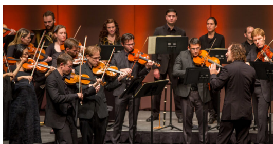
Mercury Chamber Orchestra opens 2020 Lenten Recital Series February 27 at 12:15 pm.