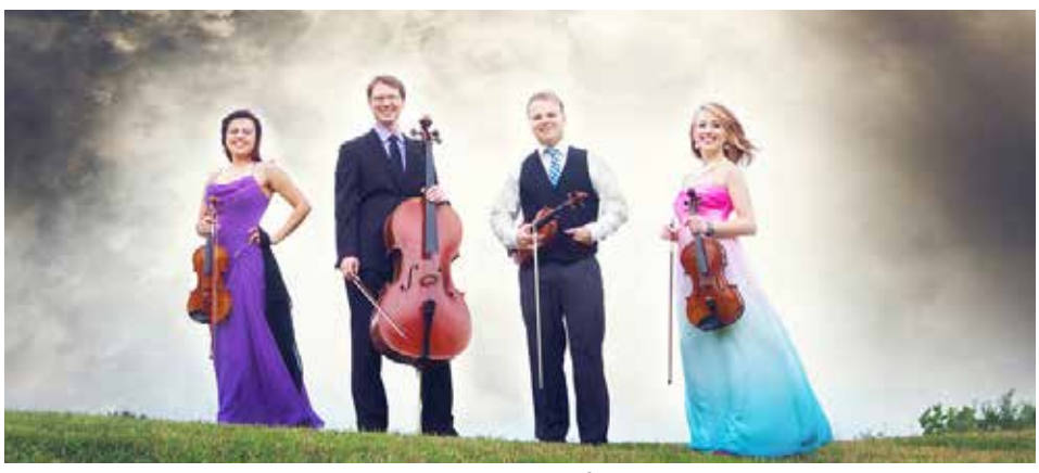
The Apollo Chamber Players will present a Music for Peace concert on Tuesday, April 5, at 7 pm in St. Paul's Sanctuary. All proceeds from this concert will be distributed to support the people of Ukraine through humanitarian relief through UMCOR, the United Methodist Committee on Relief ( umcmission.org/umcor/ukraine ) For more about Apollo, including samples of their work, see www.apollochamberplayers.org .