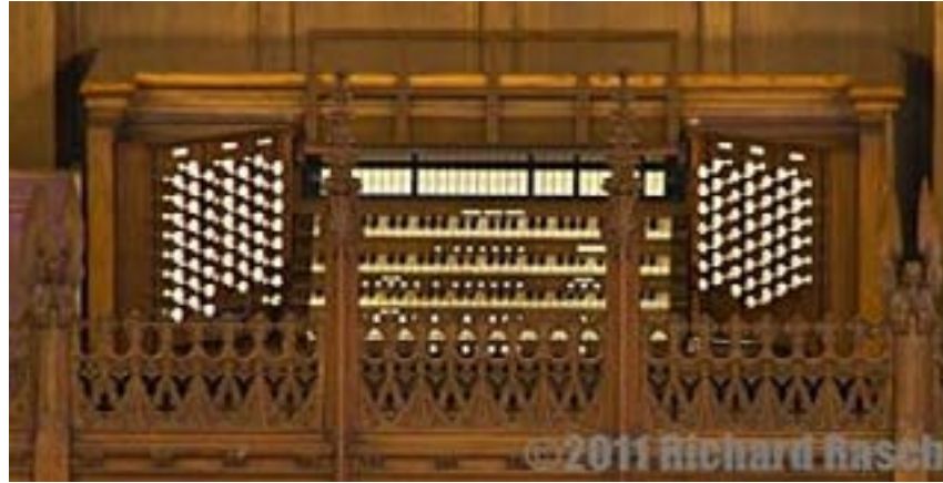
Above: Console of St. Paul's Grand Organ, an 84-rank Schantz organ