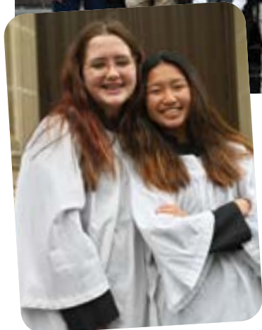
Photos from Youth Led Worship 2022